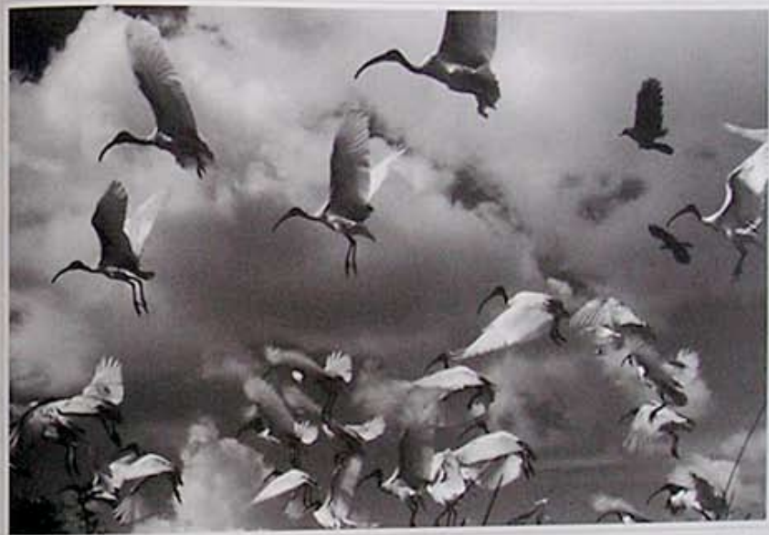
White Tern, Rangoon