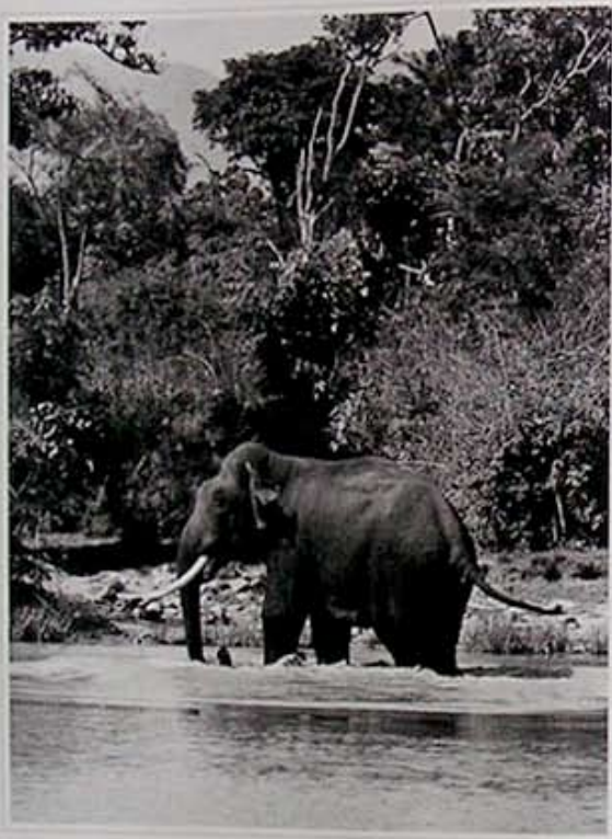
Elephant, Bangkok R.N.S. Day