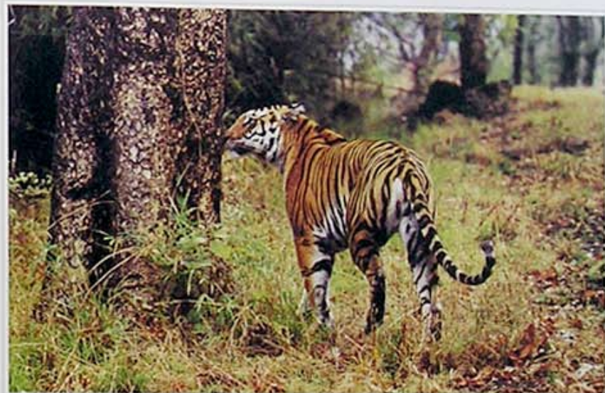
Tiger, Nilgiri, Kashmir